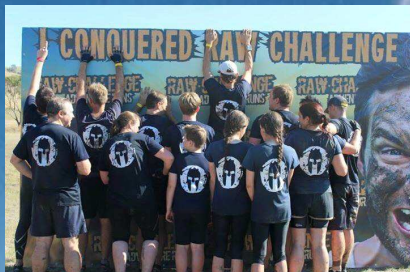
Team Tazfit after completing the Raw Challenge TAS